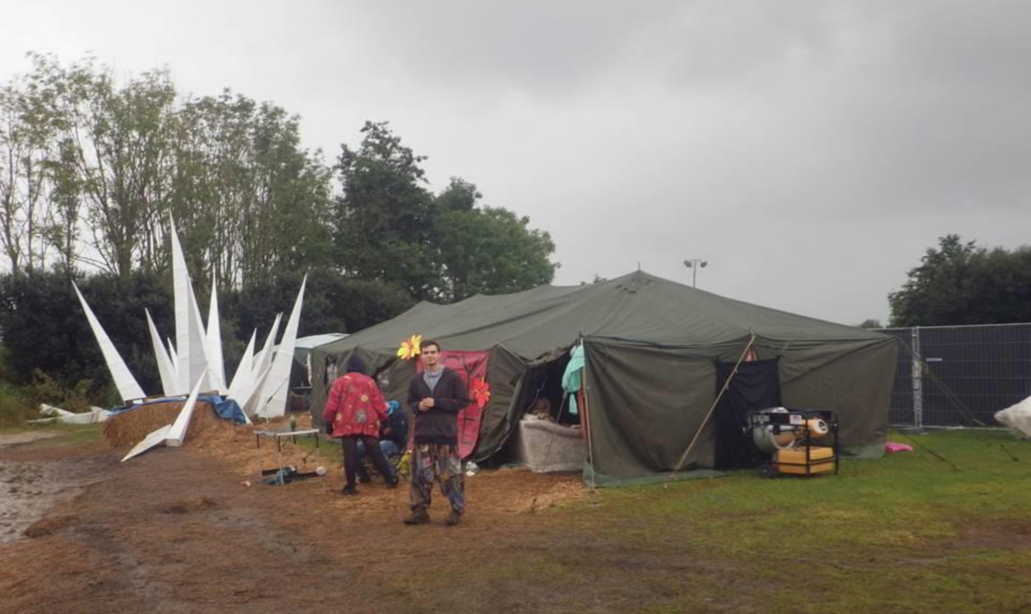
Psycare tent @ Psy-Fi Festival (NL) 2015