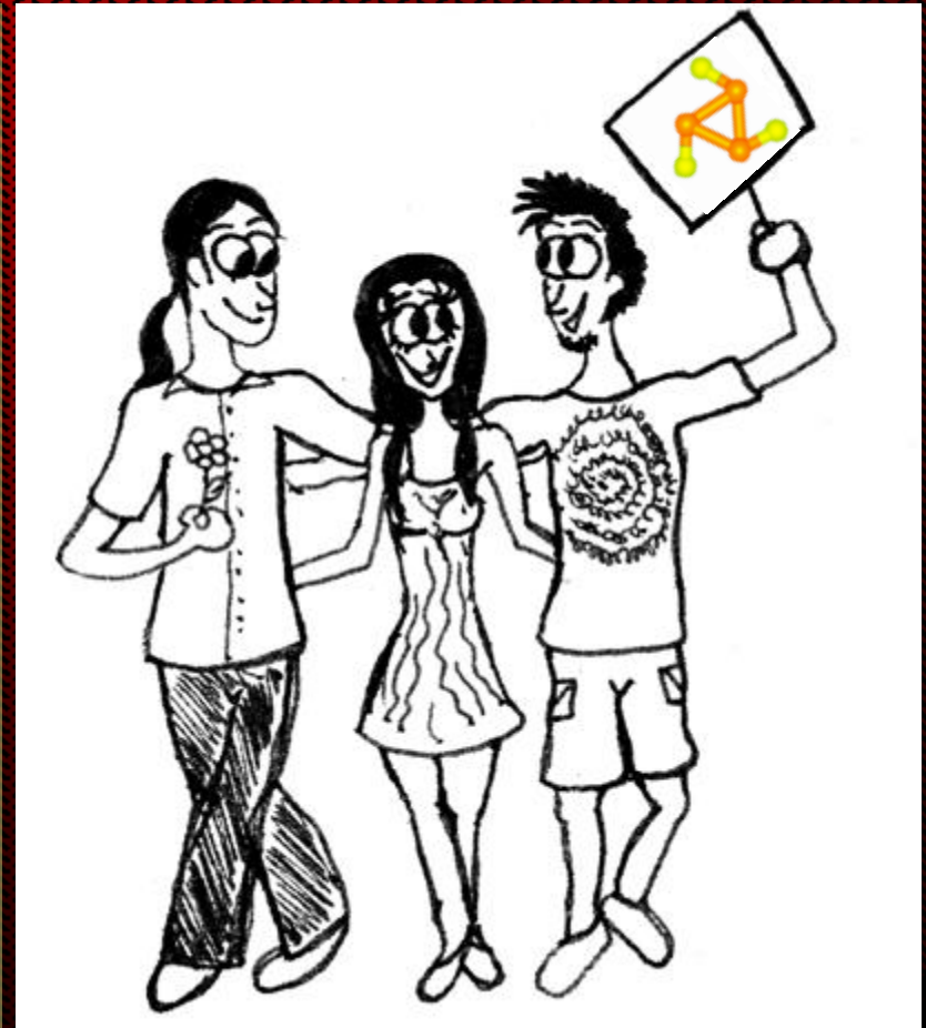
DÁT2 Psy Help team