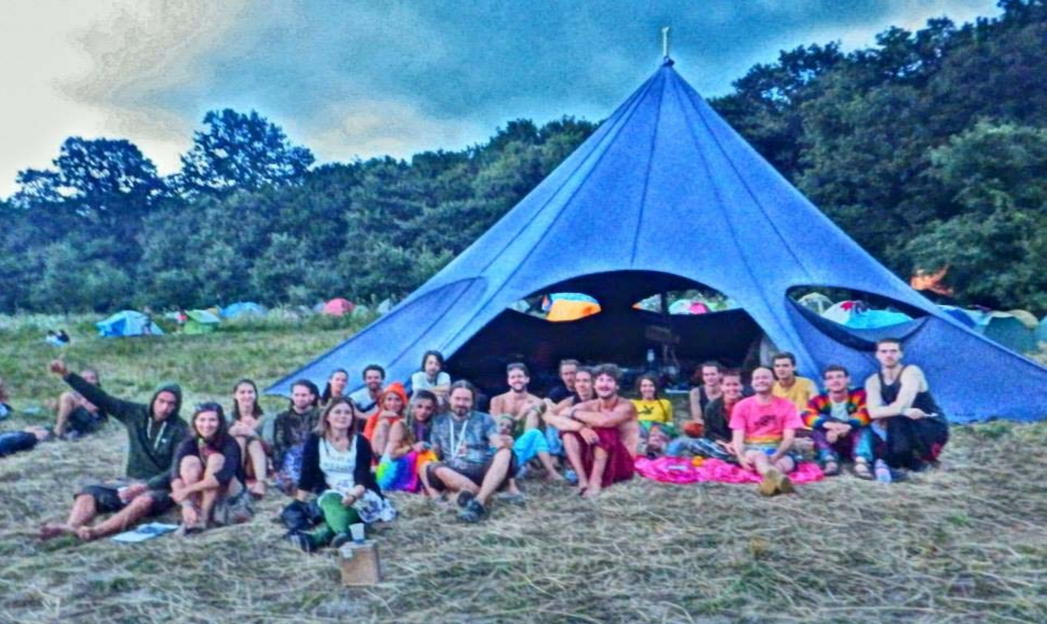
Psy Help team @ S.U.N. Festival (HU) 2014