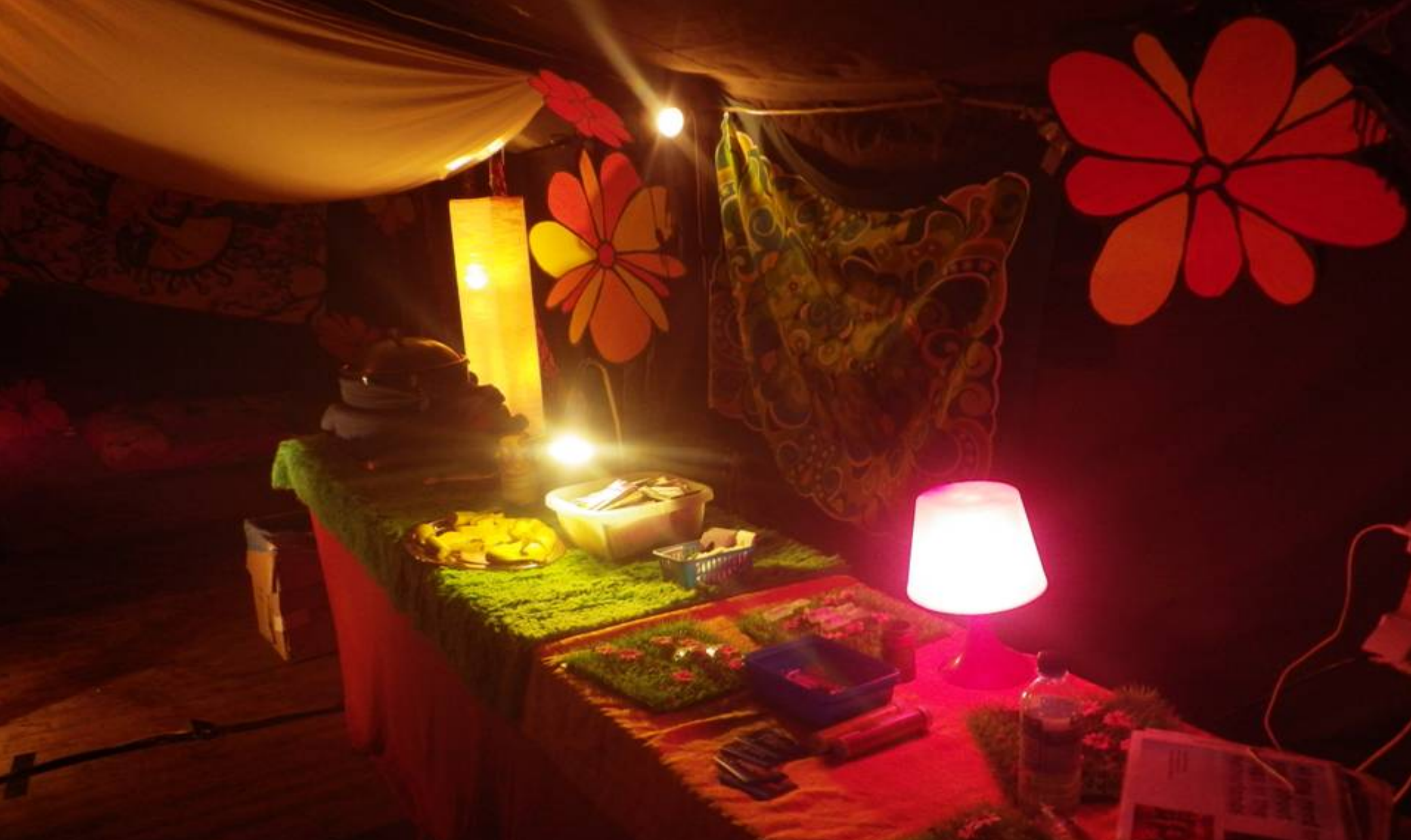
Psycare space @ Psy-Fi Festival (NL) 2015